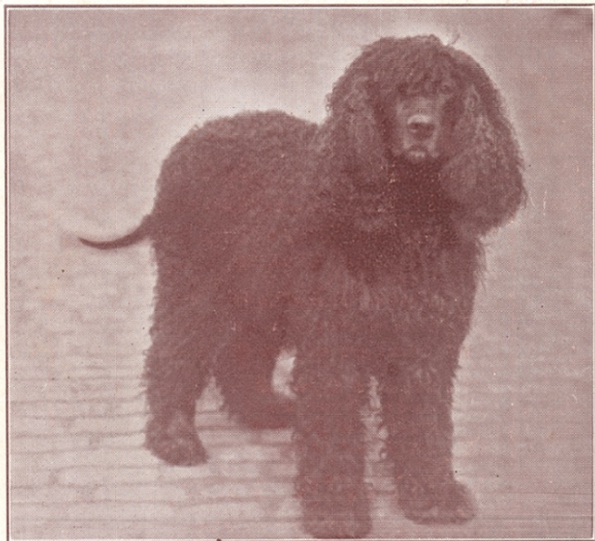
CHAMPION "THE ROSE OF SHARON." K.C.S.B. 1256 D.D.